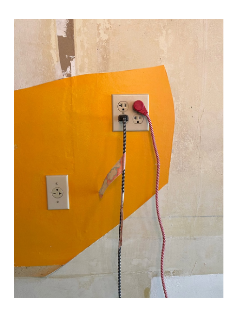
Studio of the artist.